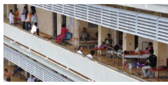
Soviet Khmer Friendship Hospital Phnom Penh